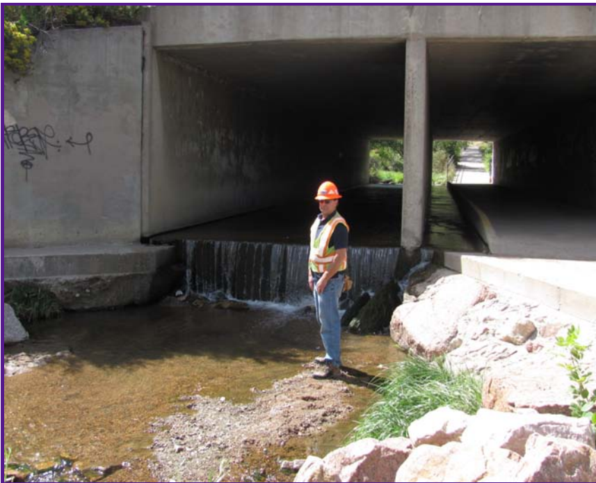
I17EI Outlet of cell 1.JPG

\\public\bridge common\briar please use this\blue\damage\