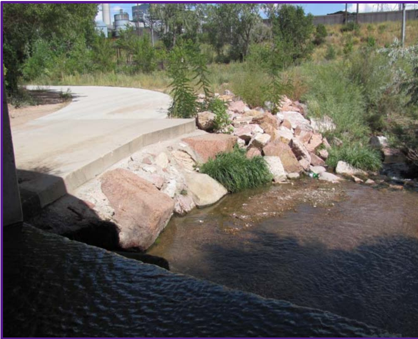
I17EI Rip Rap placed along bike path slope East side.JPG